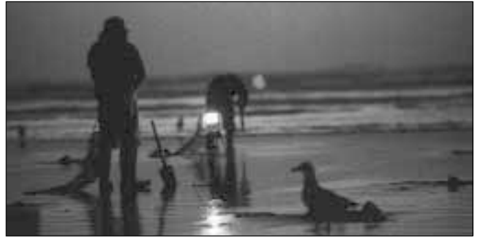
Quinault Nation members begin a commercial razor clam dig in the waning minutes of sunset on Roosevelt Beach area south of Taholah.

“An ongoing discussion about domoic acid is whether it’s been in shellfish all along or not. Since we didn’t start testing for it until 1991 it’s hard to say,” Schumacker said. Additionally, the levels determined harmful to humans were based on the mussels that caused the deaths, not clams or crabs. That fact is important because each species of shellfish stores the toxin in different ways. For instance, crabs retain a great deal of the toxin in the viscera or guts. Even if the whole crab is too high in domoic acid, with proper